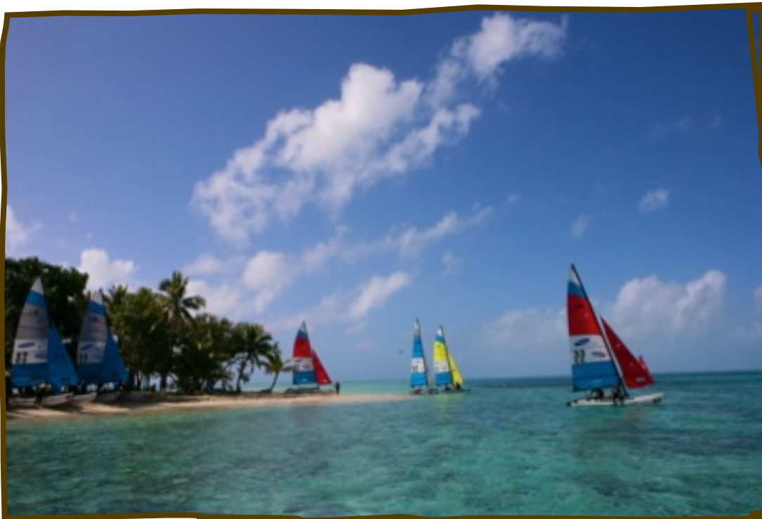
Fiji Hobie Challenge 2009, Leleuvia